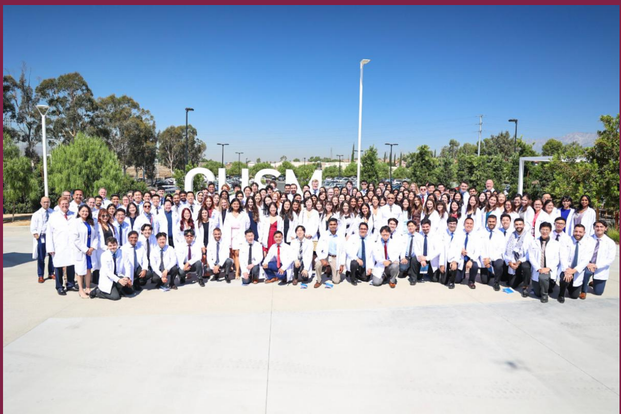
MD Class of 2028 alongside some of the CUSM faculty at the White Coat Ceremony.